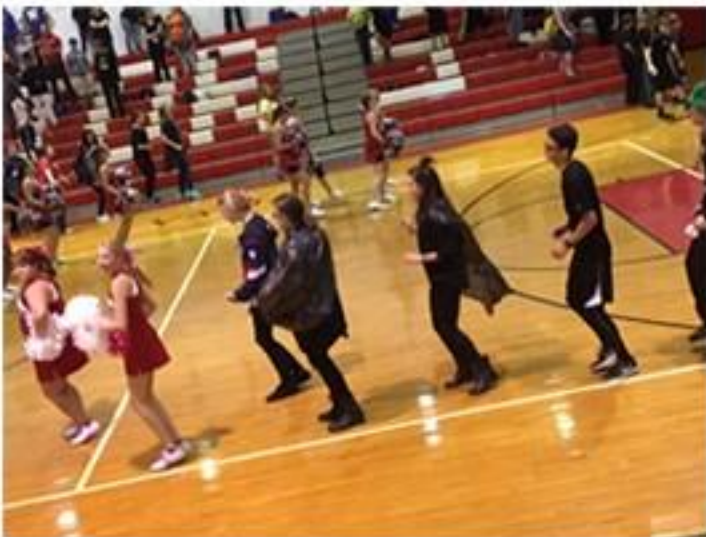
Cheerleaders lead students in the cupid shuffle.