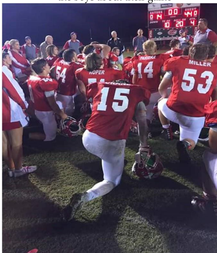
After a tough fight, the coaches talk to the boys about their game

Our varsity football team had the chance to take a breather on Friday, October 7th. They had a game on Friday, October 14th, against Cottondale, which was a district game. Sadly, after a long fight, they lost with a score of 44-14 . Their Homecoming game, against Graceville, and their Senior Night game, against Holmes County, are both district games. So far the football team's district record is tied at 1-2. The next two games are not only district games, but also home games, which hopefully means that the team will have plenty of support for these next few tough games.