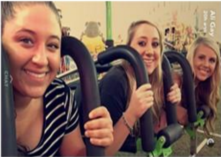
Gators enjoying a ride at the fair.