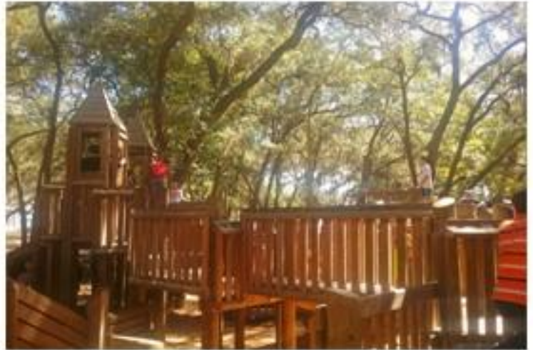
Under the Oaks Park is a great place for a field trip!