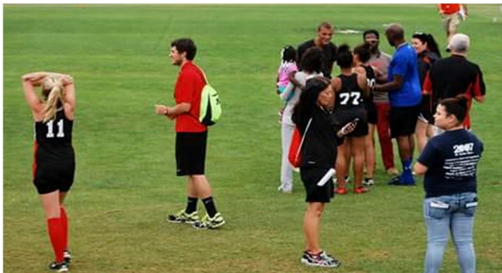
The cross country team cooling off after a hard race.