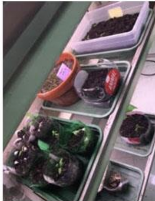
Students planted a variety of plants to transport to the garden later on

The students planted a wide variety of plants. Some they planted in a container first, then transplanted them into the garden. Some, like the watermelons, were started directly in the garden. So far they have planted strawberries, greens, carrots, beans, pumpkins, and squash. The class has plans for storage sheds, greenhouse boxes, a compost bin, and even redoing the flower beds around the school.