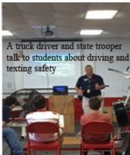
A truck driver and state trooper talk to students about driving and texting safety

Committed To Safety traveled to WHS on September 16 to speak to our students about the importance of not texting when you are driving. They showed video clips of things that have happened and how texting while driving can end someone's life. WHS would like to thank our wonderful principal, Jay Bidwell, our faculty and staff for allowing them to come out and speak to us at WHS.