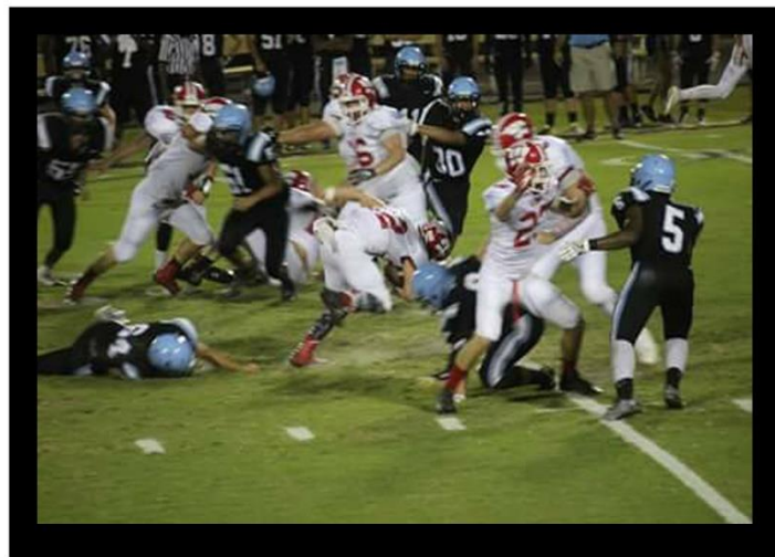
Our varsity boys block, kick, and pass the ball to a win against North Bay Haven

Our Wewa Gators have been busy during Thursday and Friday nights. JV football recently played against Sneads on Tuesday, September 22nd, and after a hard fight, sadly, lost with a score of 28-24. Our Varsity had better luck against Sneads, Friday September 16th, winning with a score of 34-33, and against North Bay Haven on September 22nd, bringing home a win with the score of 28-24. The Varsity played and lost to Vernon after a hard fight on September 29th with a score of 46-14. On October 7th, there was not a game, the boys got a chance to rest and prepare for the next game. The team and coaches have been busy gearing up to play the homecoming game on October 28th. These last few games have been so close and WHS is super proud of how hard our boys are fighting. Keep up the good work Gators!