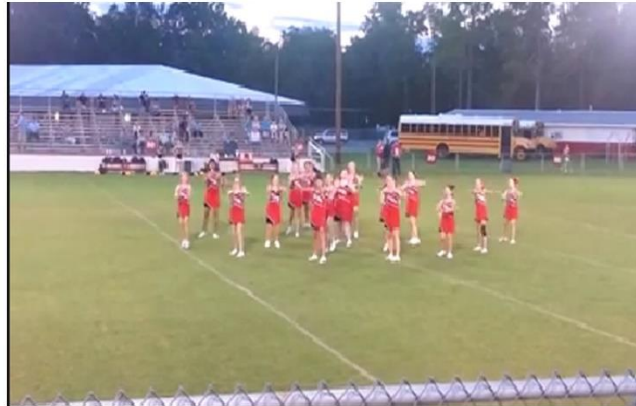
The JV cheerleaders perform a dance at the home game against Sneads