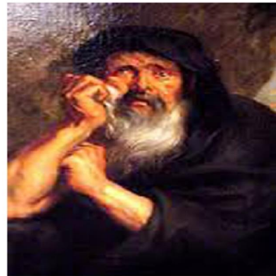
A painting of Heraclitus