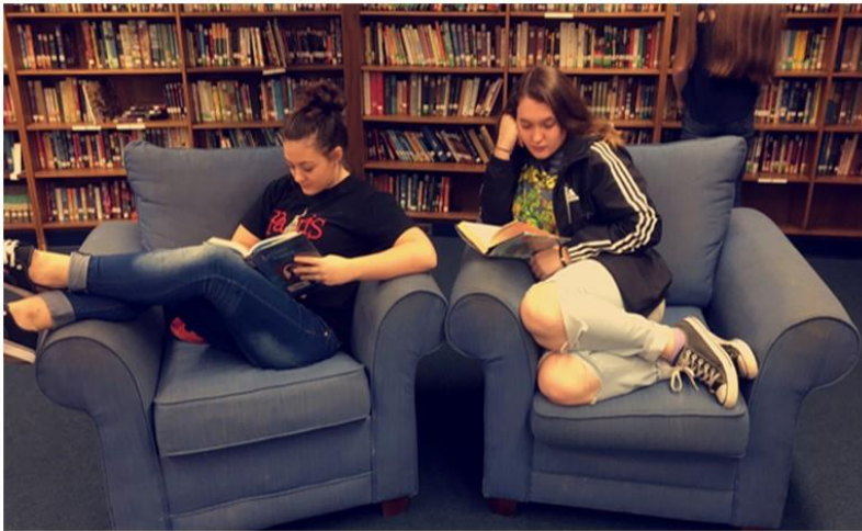
Two WHS students enjoy a book during the marathon

WHS has made a special effort to encourage students to explore the world of books. Wednesday, January 25th, the school participated in the Million Minute Marathon. The Million Minute Marathon is an event in which each class spends at least part of their time reading. The Million Minute Marathon helps students explore new books and provides a sense of stress relief for all those students overwhelmed about upcoming exams. In this year's Million Minute Marathon, WHS Students read a total of 155,040 minutes. That's a lot of time! Good Job Gators!