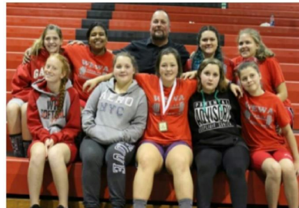
This is the team that earned 6th place at regionals, please congratulate these girls!